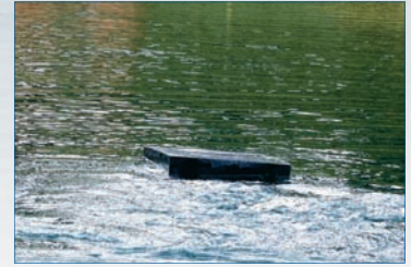
Efficiently eliminate stagnant water