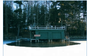
Prevent winter kill and protect structures from ice damage